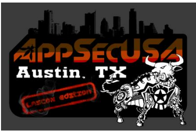
EXHIBIT SHOW CONTACTS

Send questions and requests to: appsecusa@owasp.org